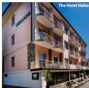
The Hotel Helios