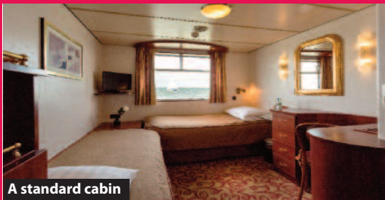
A standard cabin